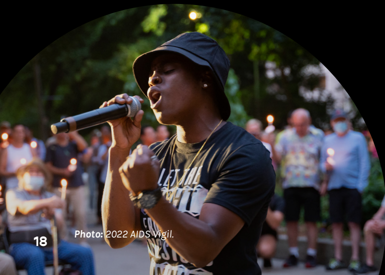
Photo: 2022 AIDS Vigil.

As our communities always have, we join in strength and fury with one another as there is no equity without solidarity.