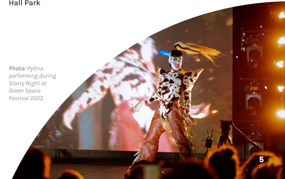
Photo: Pythia performing during Starry Night at Green Space Festival 2022.