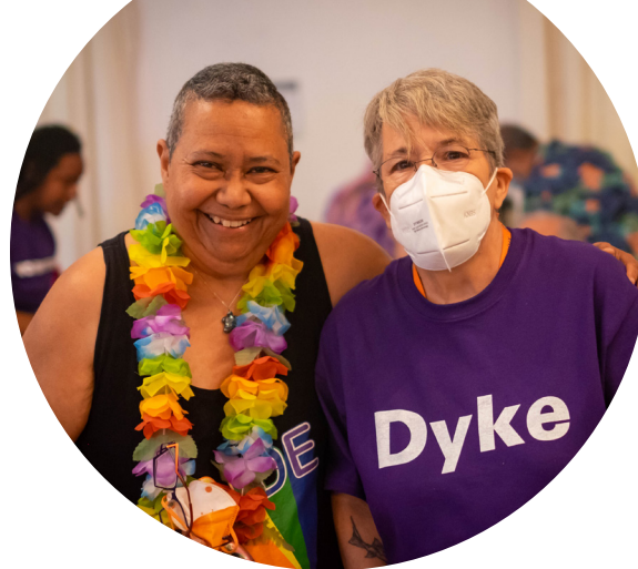
Photo: Celebrating at 2SLGBTQ+ Older Adults pride celebration 2022.

In 2022, we celebrated pride with a trans prom and created a Meal Trans yearbook. We worked closely with our Trans People of Colour Project and Breaking The Ice team to provide integrated program support and referrals, and held 45 program sessions with 925 attendees.