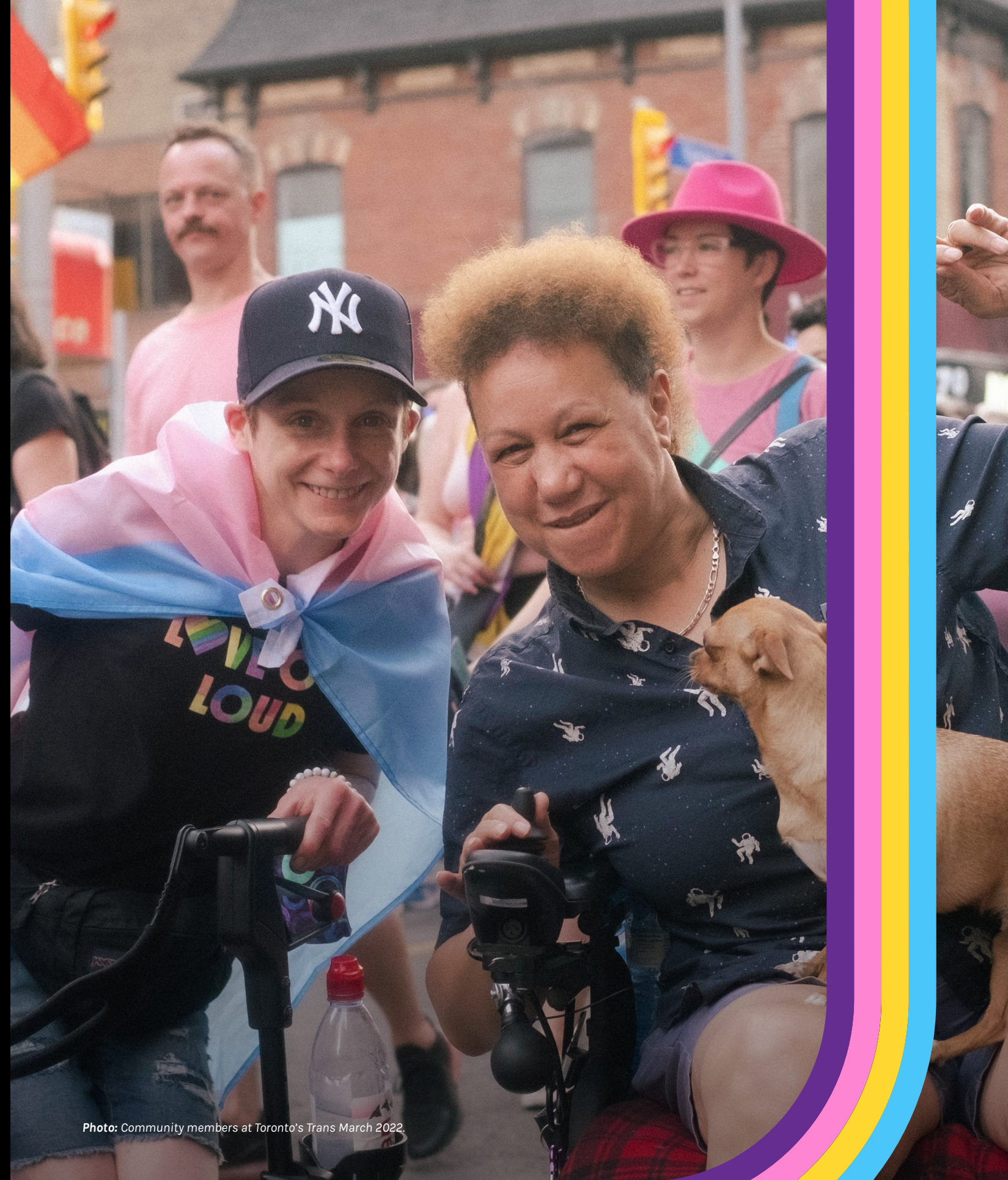
Photo: Community members at Toronto's Trans March 2022.