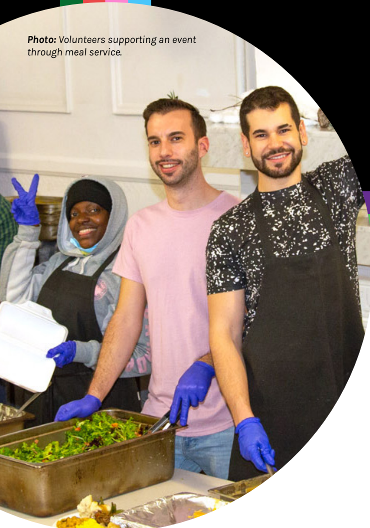
Photo: Volunteers supporting an event through meal service.

distributed via the Pay it No Mind Fund to racialized 2 Spirit, trans, and non-binary community members in need