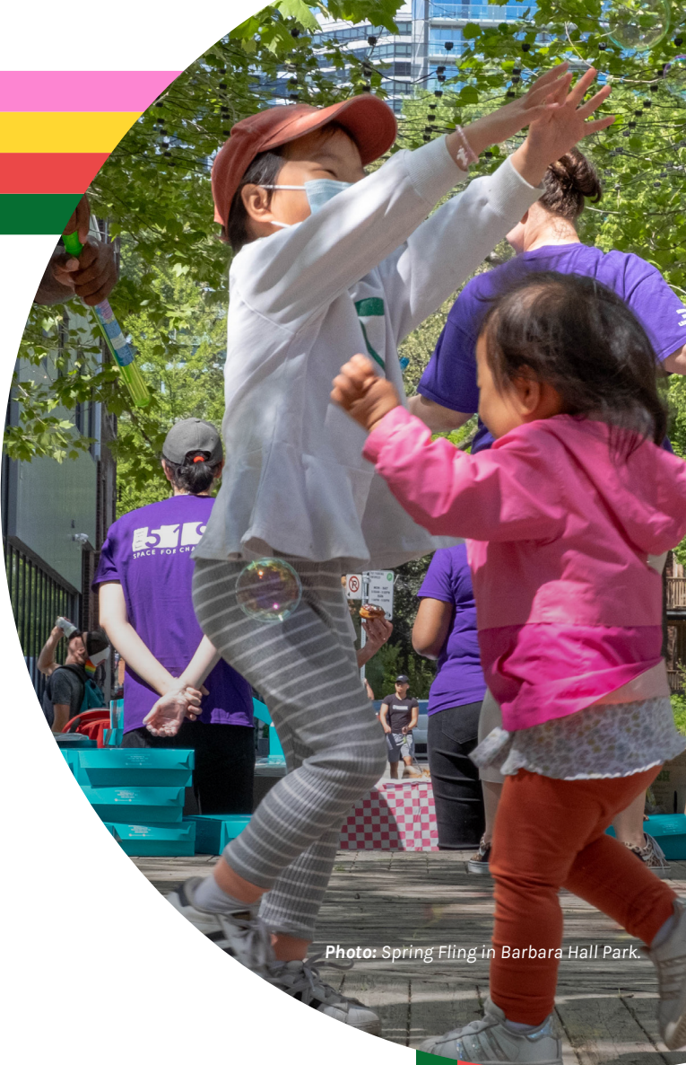
Photo: Spring Fling in Barbara Hall Park.

Our programming ranged from Arts in the Park to Zumba classes, and added up to more park-based programming than we have ever offered before.