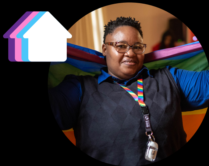
Above: Celebrating LGBTQ+ Newcomer and Refugee Pride 2022

From intake protocols to welcome packages, we worked closely with Homes First Society on developing new models of support. We also ran programs for shelter residents, ranging from orientation sessions and field trips, movie nights and personal style consultations geared towards gender-diverse residents.