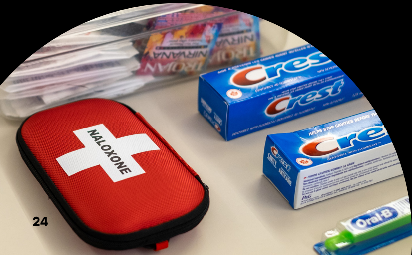
Photo: As part of their capacity building initiative, the BTI also conducted training with The 519 staff on harm reduction philosophies and responses, the use of naloxone kits, and more.

drop-in sessions held with dedicated peer support with 2SLGBTQ+ people who use drugs