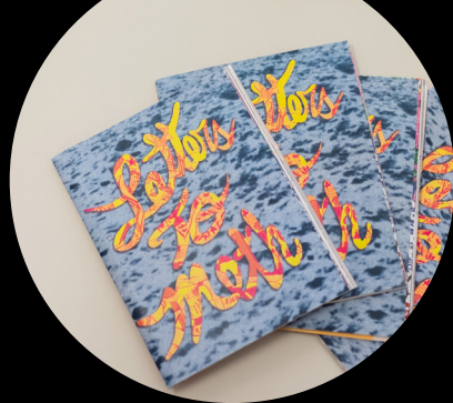
Photo: Letters to Meth, a zine created in collaboration with community by the BTI team.

Breaking The Ice (BTI) is a community engagement and outreach program focussed on supporting people who use crystal meth in the Church-Wellesley Village and the broader Downtown East. BTI engages peer leaders with lived experience and engages peers in trainign and capacity building to meaningfully engage 2SLGBTQ+ people who use drugs. These team supports folks via street outreach, through enhanced supports in existing drop-ins, and by running monthly breakout programming tailored to support people in drug using communities.