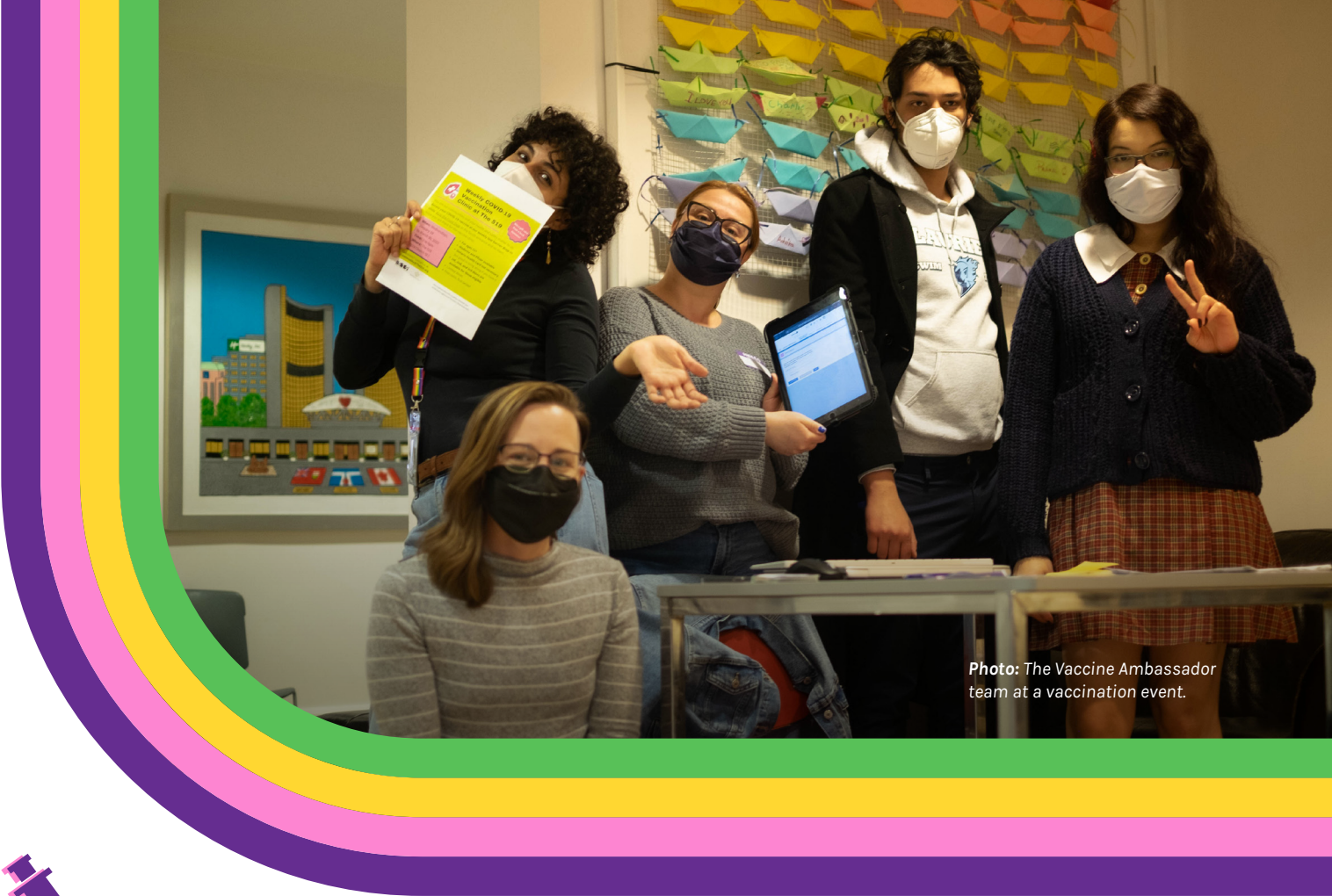
Photo: The Vaccine Ambassador team at a vaccination event.

hours of outreach by vaccine ambassadors