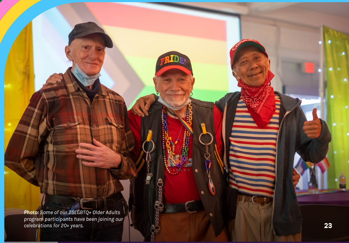
Photo: Some of our 2SLGBTQ+ Older Adults program participants have been joining our celebrations for 20+ years.

We have supported community members' skills-building by providing them opportunities to develop and lead workshops, including an improvisation workshop and a dance and movement workshop. This year, we focussed on adding outings and field trips to Sunday Drop-In, including visits to the ROM, Riverdale Farm, and hosting a swim day at Christie Pits Pool, while still providing services that meet folks' immediate needs such as haircuts, ODSP advocacy, skills workshops, and on-site counselling referrals.