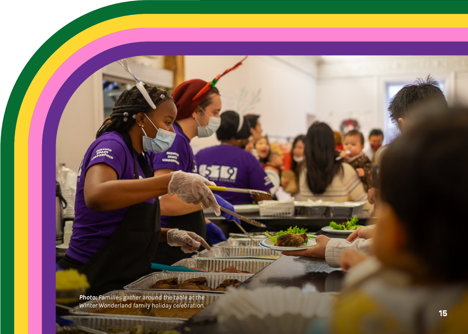
Photo: Families gather around the table at the Winter Wonderland family holiday celebration.

At last, 2022 saw a return of many of our community-led groups , with 49 groups beginning or returning to regular space use. Along with community meetings, Kiki Balls, conferences and holiday parties, nothing makes us feel more like we're at home than a building filled with our communities.